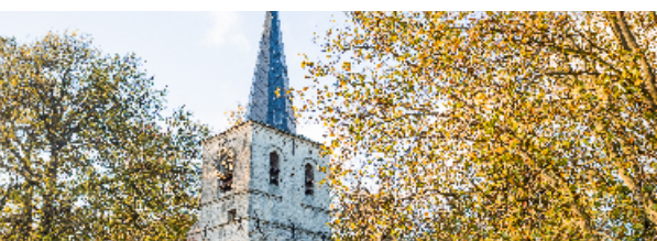
Church Tower in Muizen