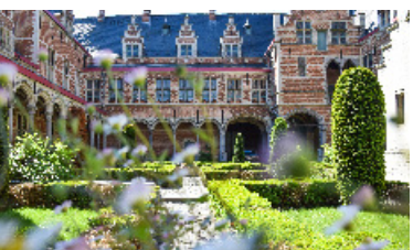
Palace of Margareta of Austria

The Zennegat is where the Dyle and Zenne rivers and the Leuven-Dyle canal meet. Artists are among those attracted to this idyllic hamlet by its characterful little houses, the colourful spectacle of the pleasure craft and houseboats, and its ecologically important landscape. A little further along, the Dyle and the Nete converge in the Rupel at the aptly named Drie Rivierenpunt, or point of the three rivers.