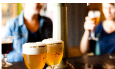
Het Anker Brewery, Gouden Carolus