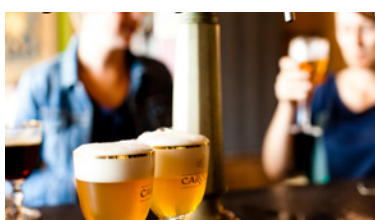
Het Anker Brewery-Distillery, Gouden Carolus