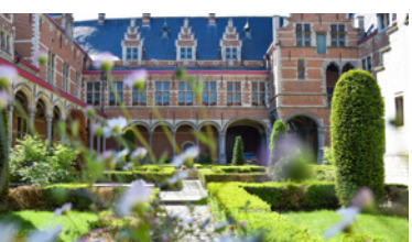
Palace of Margareta of Austria